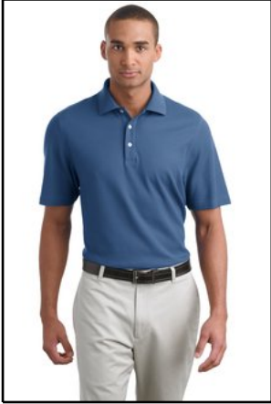
NEW Port Authority®- EZCotton™ Pique Sport Shirt. K800

Make a strong first (and 20th) impression. Proven in independent lab tests to maintain its appearance up to 20 washes, the EZCotton Pique Sport Shirt has an anti-curl collar and resists pilling, fading, wrinkling and shrinking with ease. Crafted from super soft 100% long-staple cotton, the EZCotton Pique Sport Shirt has a professional appearance that simply won't wash away.