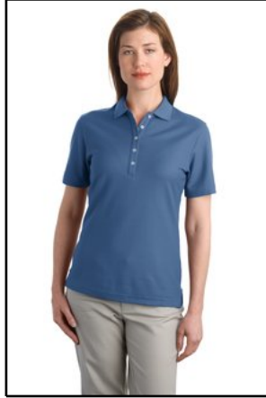
NEW Port Authority®- Ladies EZCotton Pique Sport Shirt. L800

Available colors: Black, Brown, CobaltBlue, DustyOrange, EmeraldGreen, GreenOasis, MaizeYellow, MoonlightBlue, Navy, Oyster, TomatoRed, White