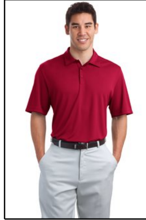
NEW Port Authority®- Bamboo Charcoal Birdseye Jacquard Sport Shirt. K498

Available colors: Black, Brown, CobaltBlue, DustyOrange, EmeraldGreen, GreenOasis, MaizeYellow, MoonlightBlue, Navy, Oyster, TomatoRed, White