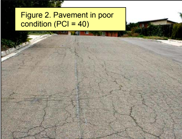
Figure 2. Pavement in poor condition (PCI = 40)

Based on the results of this study, approximately $51.7 billion of additional funding is needed to bring just the pavement condition of the state’s local streets and roads to a level where the taxpayer’s money can be spent cost-effectively.