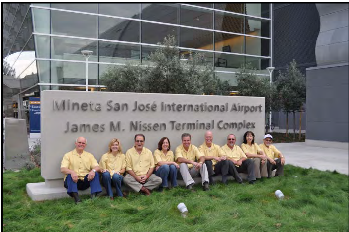
NACE 2014 Committee Scouting Out The Way to San Jose

An ad hoc CEAC committee is hard at work in making preparations for a presentation at the upcoming NACE Annual Meeting in April in an effort to bring the national conference to San Jose in 2014 during CEAC's 100th anniversary year. Members are encouraged to attend the NACE conference and be a part of the support for this effort. CEAC last hosted the conference in 2002 with great success.