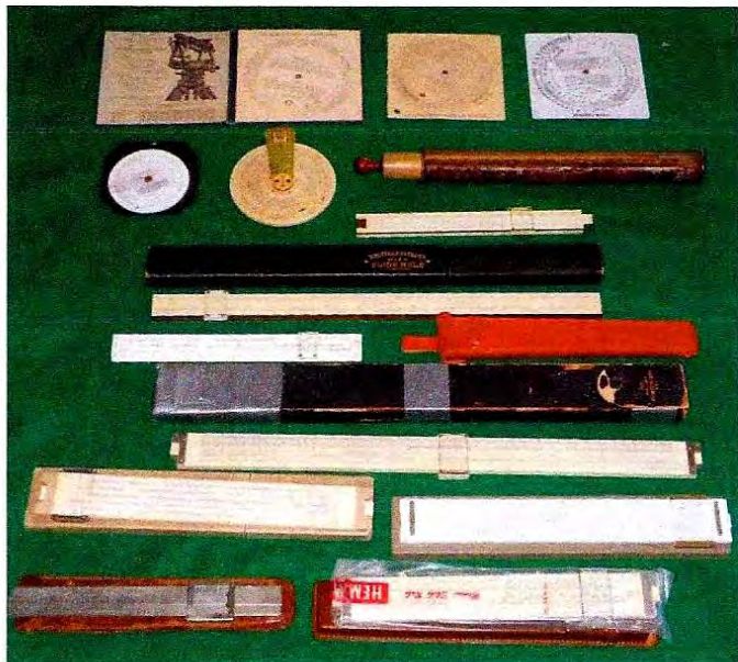
FIGURE 1. 15 Stadia Slide Rules

One can see from the number of makers of these rules that stadia slide rules were a popular specialty model. The K&E Colby Stadia Rule and the Aristo 10065 are not in this collection and surely there are many others. The rules provide the needed accuracy of calculation appropriate for small topographical work and were an improvement over such calculations using 10 and 12 place logarithmic tables and trigonometry functions. Stadia rules are such an improvement that I now wonder why I had to use log tables to solve these problems in surveying class long ago at a university. The Rhodes Arc provided another means of direct reading of horizontal and vertical distances, used principally for taking cross section dimensions in earthwork calculations, but that is another field of study.