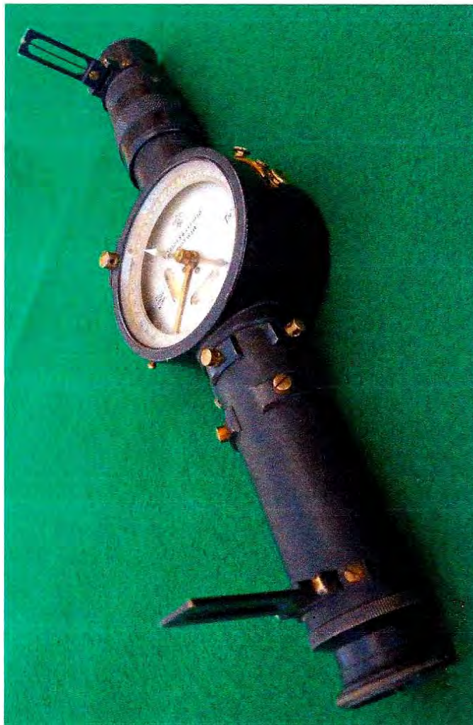
FIGURE 2. K&E Stadia Hand Transit, N5376S

One can see from the number of makers of these rules that stadia slide rules were a popular specialty model. The K&E Colby Stadia Rule and the Aristo 10065 are not in this collection and surely there are many others. The rules provide the needed accuracy of calculation appropriate for small topographical work and were an improvement over such calculations using 10 and 12 place logarithmic tables and trigonometry functions. Stadia rules are such an improvement that I now wonder why I had to use log tables to solve these problems in surveying class long ago at a university. The Rhodes Arc provided another means of direct reading of horizontal and vertical distances, used principally for taking cross section dimensions in earthwork calculations, but that is another field of study.