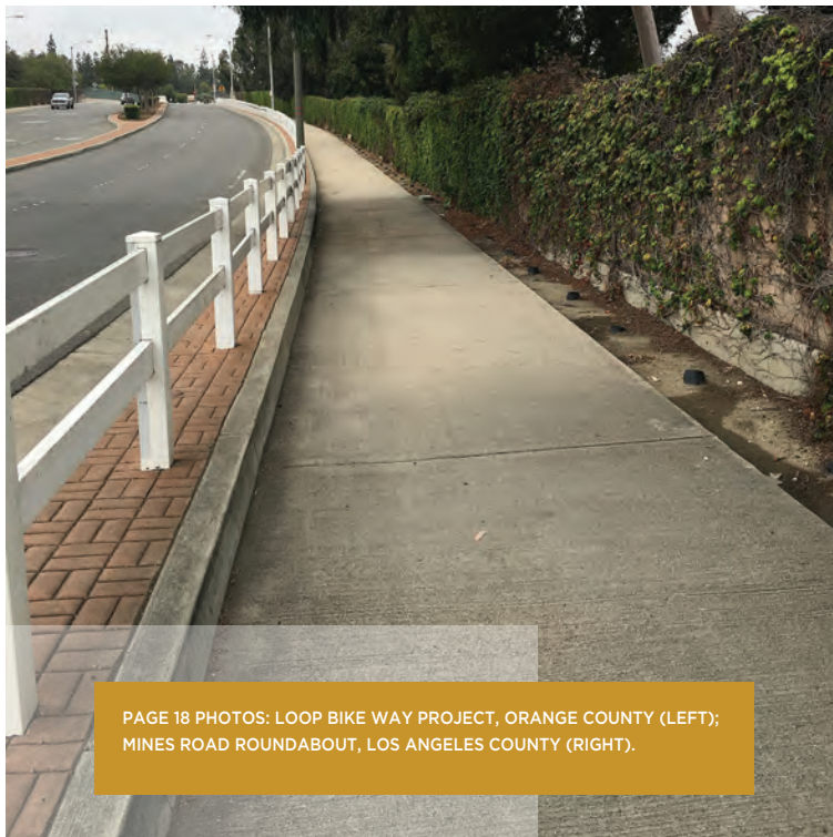
PAGE 18 PHOTOS: LOOP BIKE WAY PROJECT, ORANGE COUNTY (LEFT); MINES ROAD ROUNDABOUT, LOS ANGELES COUNTY (RIGHT).

Finally, CSAC stands with the county family and all of the dedicated public servants working to respond to wildfires, providing critical services and helping our communities recover from the numerous disasters that impacted California this year. California's counties and the communities you serve are resilient and we are proud to work with such dedicated individuals. ●