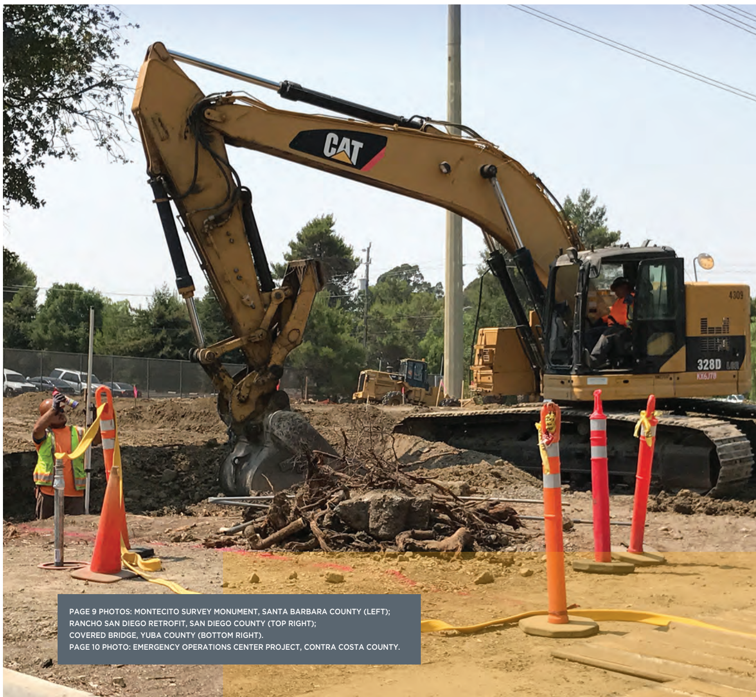
PAGE 9 PHOTOS: MONTECITO SURVEY MONUMENT, SANTA BARBARA COUNTY (LEFT); RANCHO SAN DIEGO RETROFIT, SAN DIEGO COUNTY (TOP RIGHT); COVERED BRIDGE, YUBA COUNTY (BOTTOM RIGHT). PAGE 10 PHOTO: EMERGENCY OPERATIONS CENTER PROJECT, CONTRA COSTA COUNTY.

group to “crowd source” questions to their fellow surveyors about complex and difficult property line and surveying issues, among other topics. Surveyors also engaged the Attorney General Xavier Becerra regarding a legislatively requested legal opinion on whether or not a “record of survey” would be subject to a newly enacted fee on property recording documents. ●