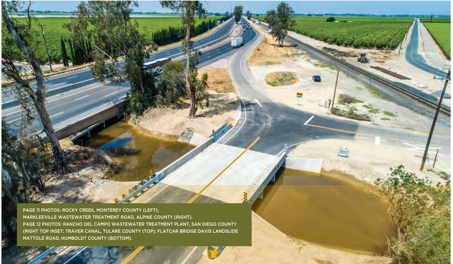
PAGE 11 PHOTOS: ROCKY CREEK, MONTEREY COUNTY (LEFT); MARKLEEVILLE WASTEWATER TREATMENT ROAD, ALPINE COUNTY (RIGHT). PAGE 12 PHOTOS: RANCHO DEL CAMPO WASTEWATER TREATMENT PLANT, SAN DIEGO COUNTY (RIGHT TOP INSET; TRAVER CANAL, TULARE COUNTY (TOP); FLATCAR BRIDGE DAVIS LANDSLIDE MATTOLE ROAD, HUMBOLDT COUNTY (BOTTOM).