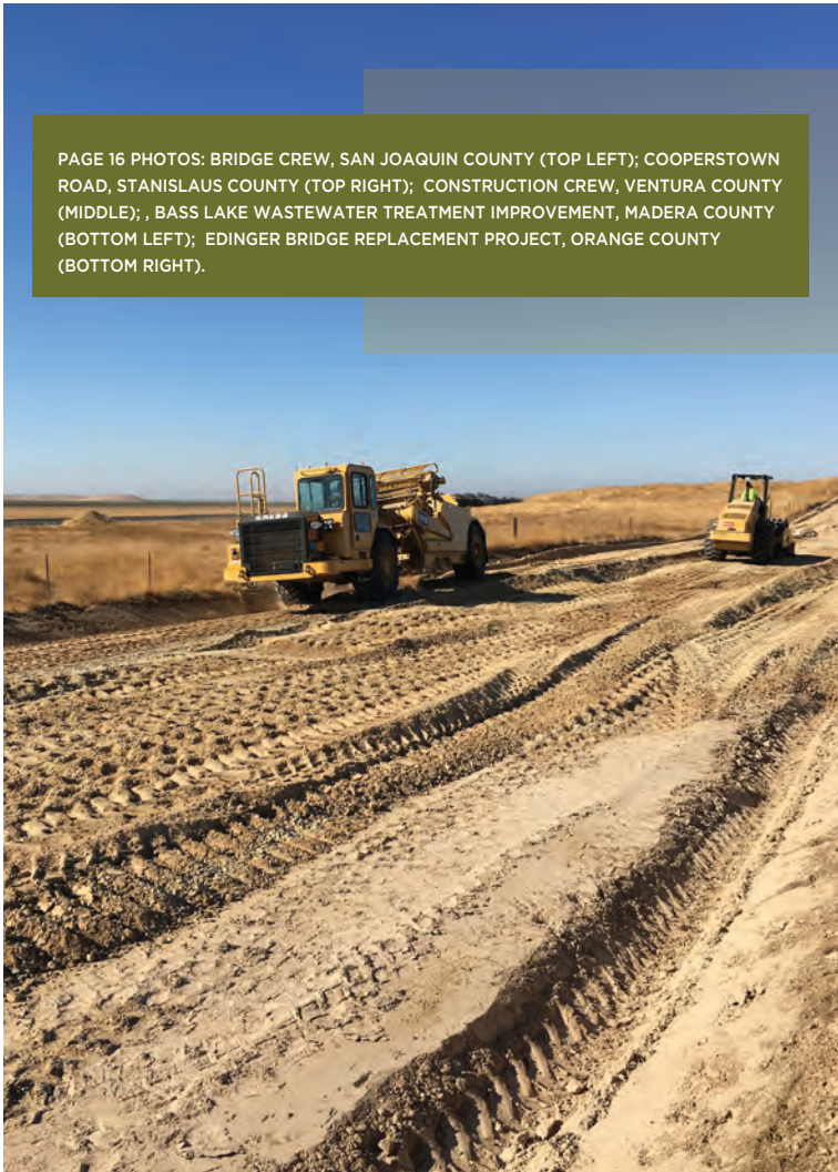
PAGE 16 PHOTOS: BRIDGE CREW, SAN JOAQUIN COUNTY (TOP LEFT); COOPERSTOWN ROAD, STANISLAUS COUNTY (TOP RIGHT); CONSTRUCTION CREW, VENTURA COUNTY (MIDDLE); , BASS LAKE WASTEWATER TREATMENT IMPROVEMENT, MADERA COUNTY (BOTTOM LEFT); EDINGER BRIDGE REPLACEMENT PROJECT, ORANGE COUNTY (BOTTOM RIGHT).