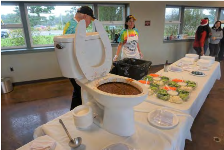
The BBQ beans at the CLODS BBQ

from your friends, the CLODS and all of CEAC