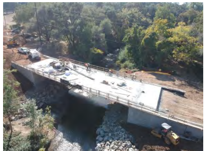
Golden Hill Bridge Replacement