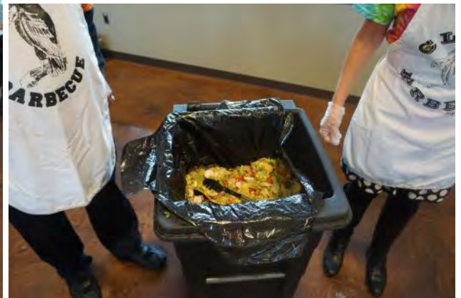
And, the "Salad Bowl" was right next to the BBQ beans