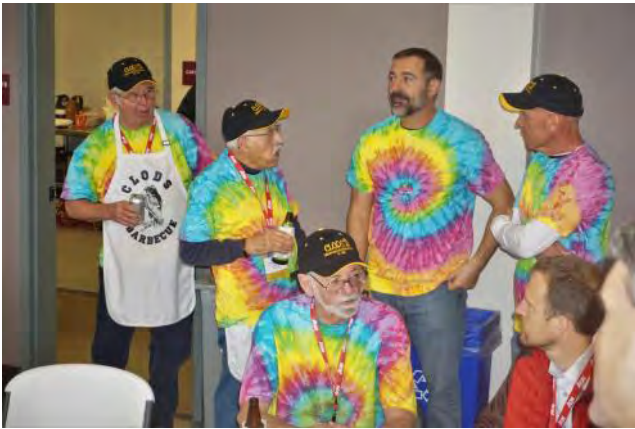
CLODS celebrating the 50th Anniversary of the 1st CLODS BBQ with an item of wear that was seen frequently 50 years ago especially in San Francisco