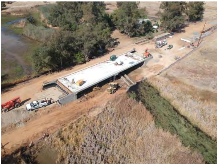
Dowd Avenue Bridge Replacement