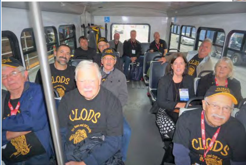
CLODS on their way to Lake Merced for the BBQ