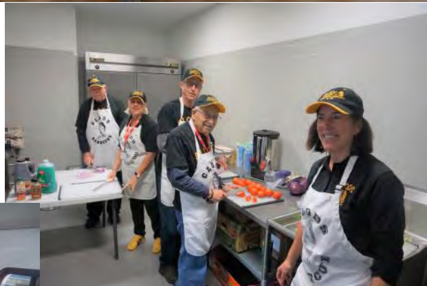
CLODS preparing the meal for the CLODS BBQ