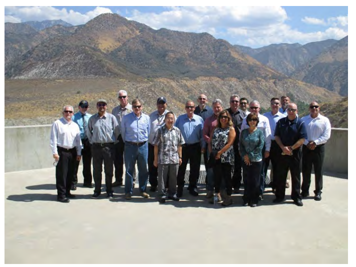
CEAC members from the Southern California Region at Seven Oaks Dam

There are several notable projects underway in Southern California Counties. Riverside County is constructing a new 6 mile expressway, Clinton Keith Road, which will connect Interstate 215 with State Route 79 to provide commuters with a new eastwest corridor serving the thousands of new residents in the Murrieta area. This project is an example of excellent environmental stewardship. Hun-