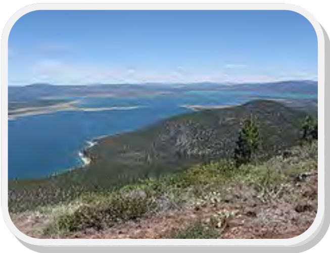
Eagle Lake - Lassen County

Soon to be Ex-President Scott was recently spotted by paparazzi in Lake Almanor, CA. Was he already applying for a new job? ....or was it the $40,000 vacation giveaway that he was really interested in?