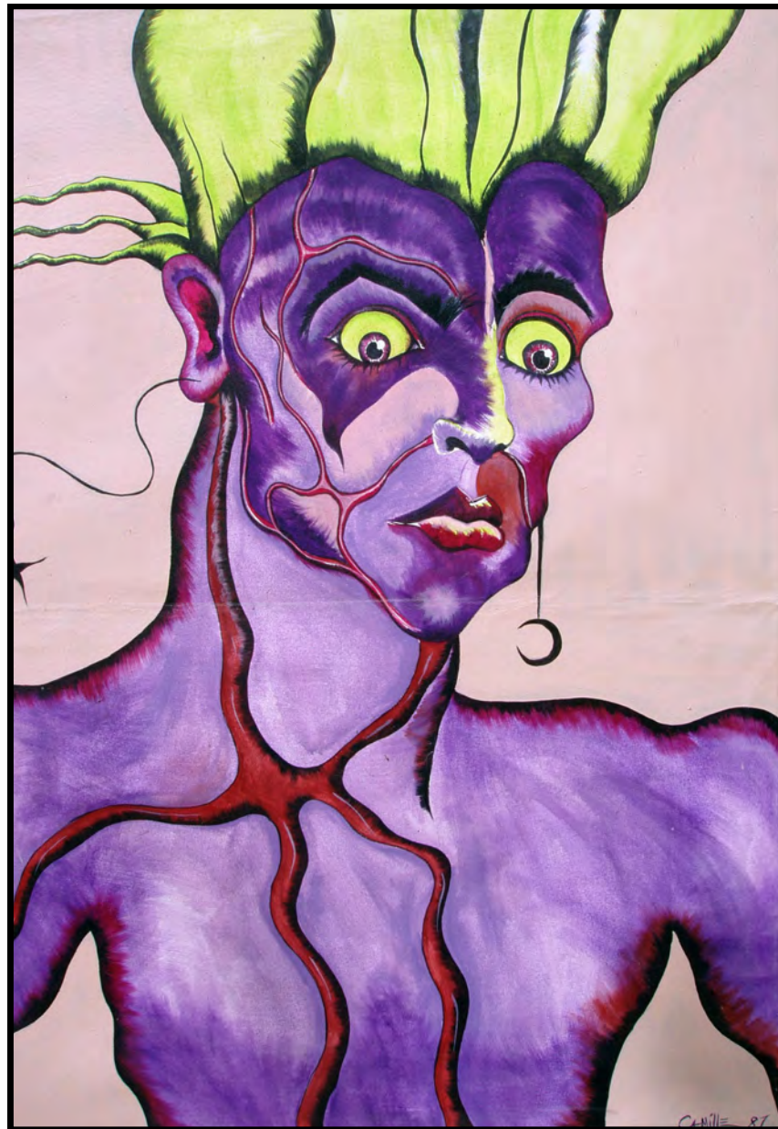
“A Self Portrait”

P.S. Should any county employee be caught with the painting, he or she will be immediately terminated.