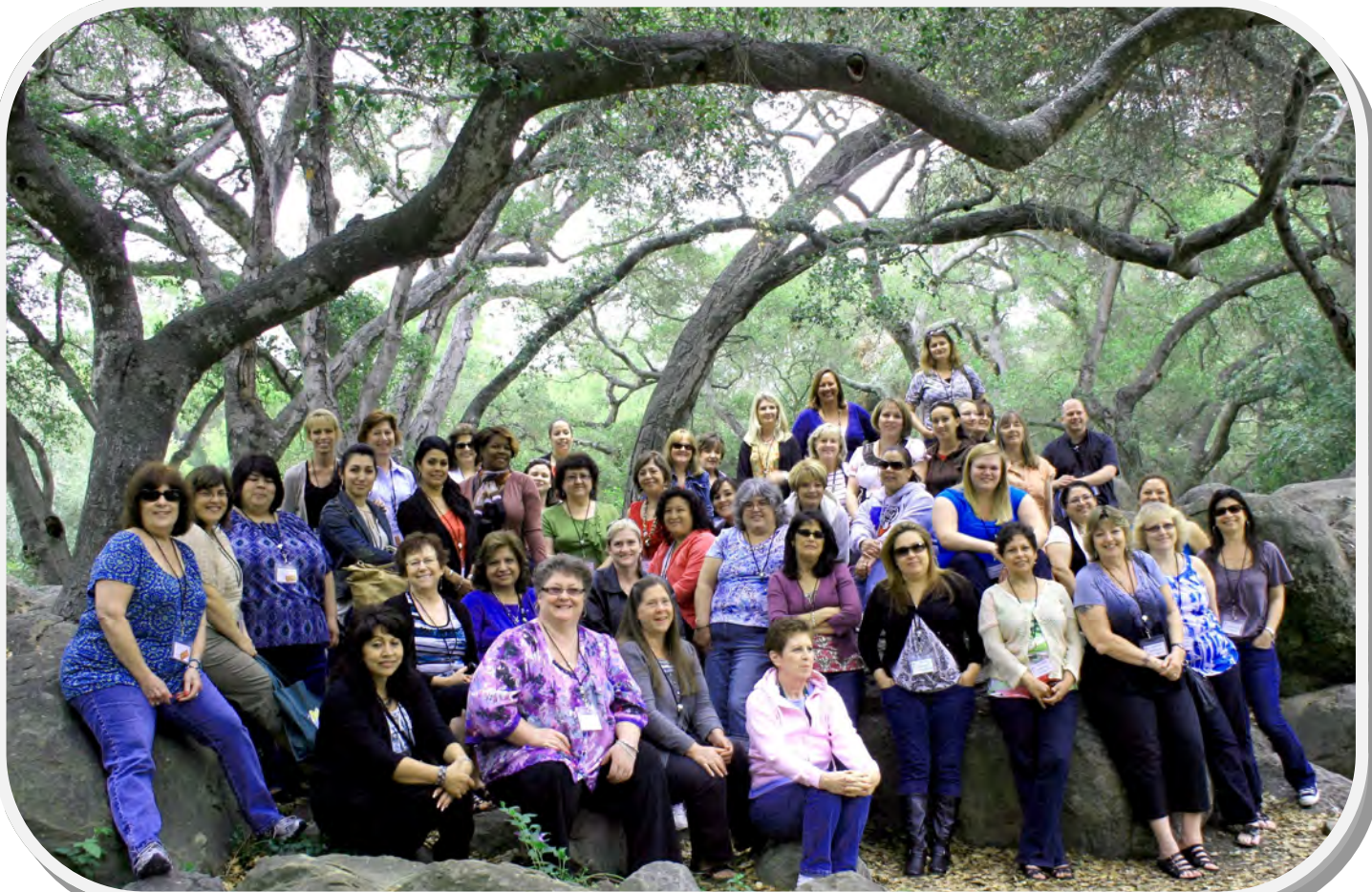
Seminar Attendees During a Lunchtime BBQ at Rocky Nook, One of Santa Barbara County's Beautiful Parks