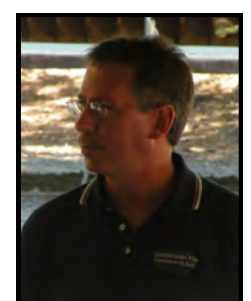
A few of the Attendees.