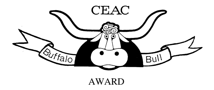
A By-Product of Grass Roots Government

This is a first call for nominations for one of CEAC's most prestigious awards that dates to 1972. Although the award is not scheduled to be presented again until the Spring 2010 Meeting, it is not too early to get your thoughts together and provide a nomination before you forget the despicable engineering misdeeds that would warrant a nomination.