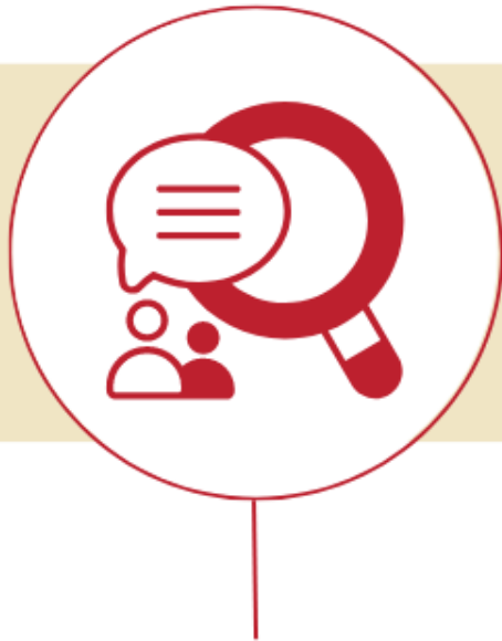
All County Survey