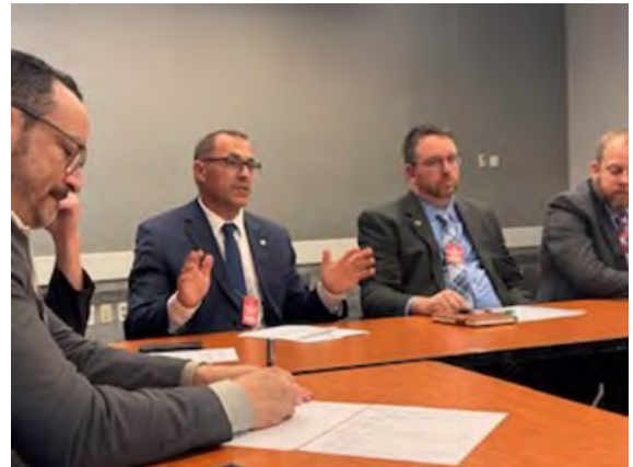
Photo from February 2025 NACE/FEMA meeting in Washington DC

Support passage of the Disaster Assistance Simplification Act (S.1528 in the 118th Congress) which would create a universal disaster application for disaster survivors.