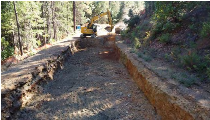
Photos from the Trinity Dam Blvd. storm damage repair project.

The storm damage is an ER project from 2017 storms. Excavation 5' deep, installing drainage, and reconstructing with a geogrid reinforced fill. The road was closed during construction.